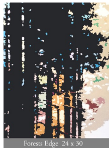
Forests Edge 24 x 30